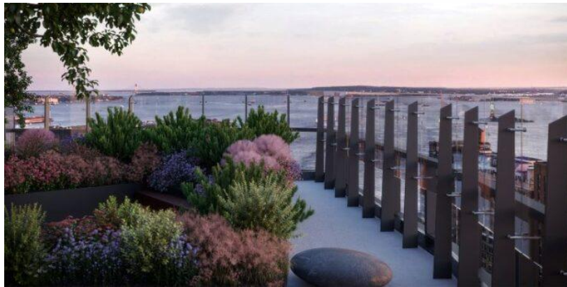
A rendering of the roof terrace

Offering panoramic views of the Upper Bay, the Statue of Liberty, and the New York City skyline, it is guaranteed to impress.