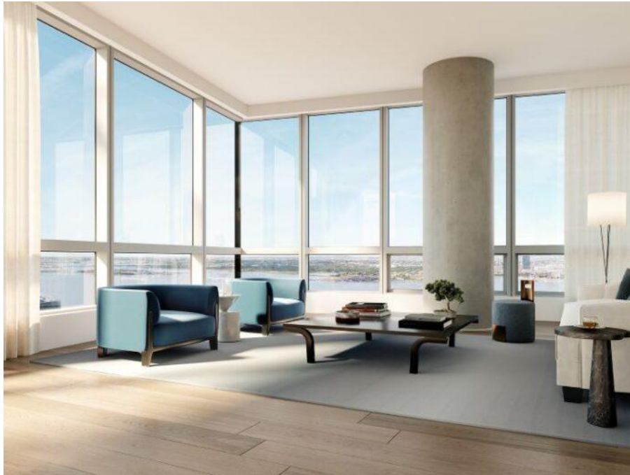
A rendering of the living room