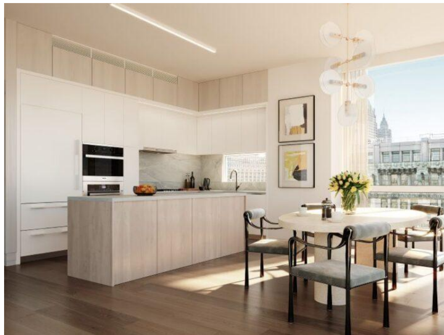
A rendering of the kitchen

Apartment 36a is 2,277 sq ft of bright and airy open-planned living space. With four bedrooms and three bathrooms, the property boasts lofty ceilings, white oak floors, and wraparound floor-to-ceiling windows to make the most of the site's unique footprint at the southernmost tip of Manhattan.